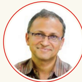
PROF. AMIT AGRAWAL

(BT/CSE/1989) Governor, Reserve Bank of India